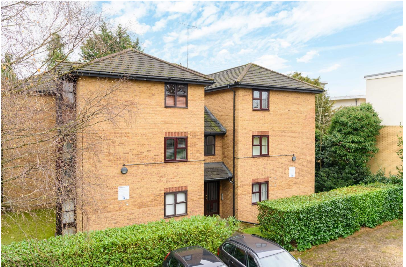
6 Moorlands Ashley Park Road Walton-On-Thames Surrey KT12 1SG